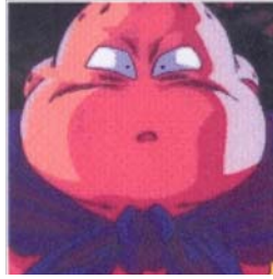
Buu aka Fat Buu