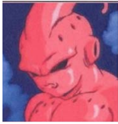
Majin Buu aka Kid Buu or True Buu