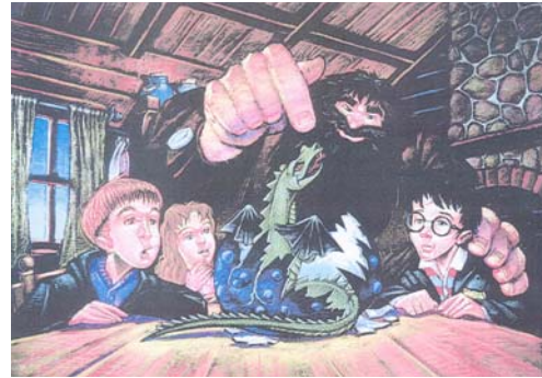
The Birth of Norbert