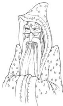
Albus Dumbledore – Expression A