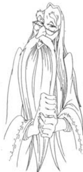
Albus Dumbledore- Expression B