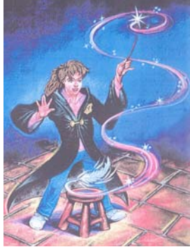
Hermione Learns to Levitate